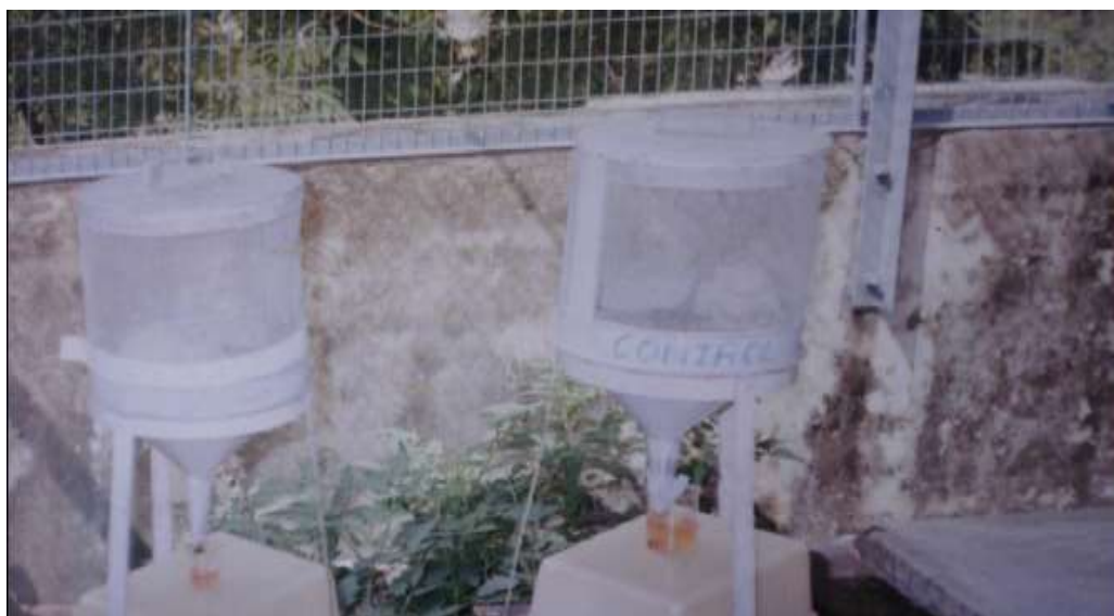
Fig. II - Wistar rats kept in metabolic cage